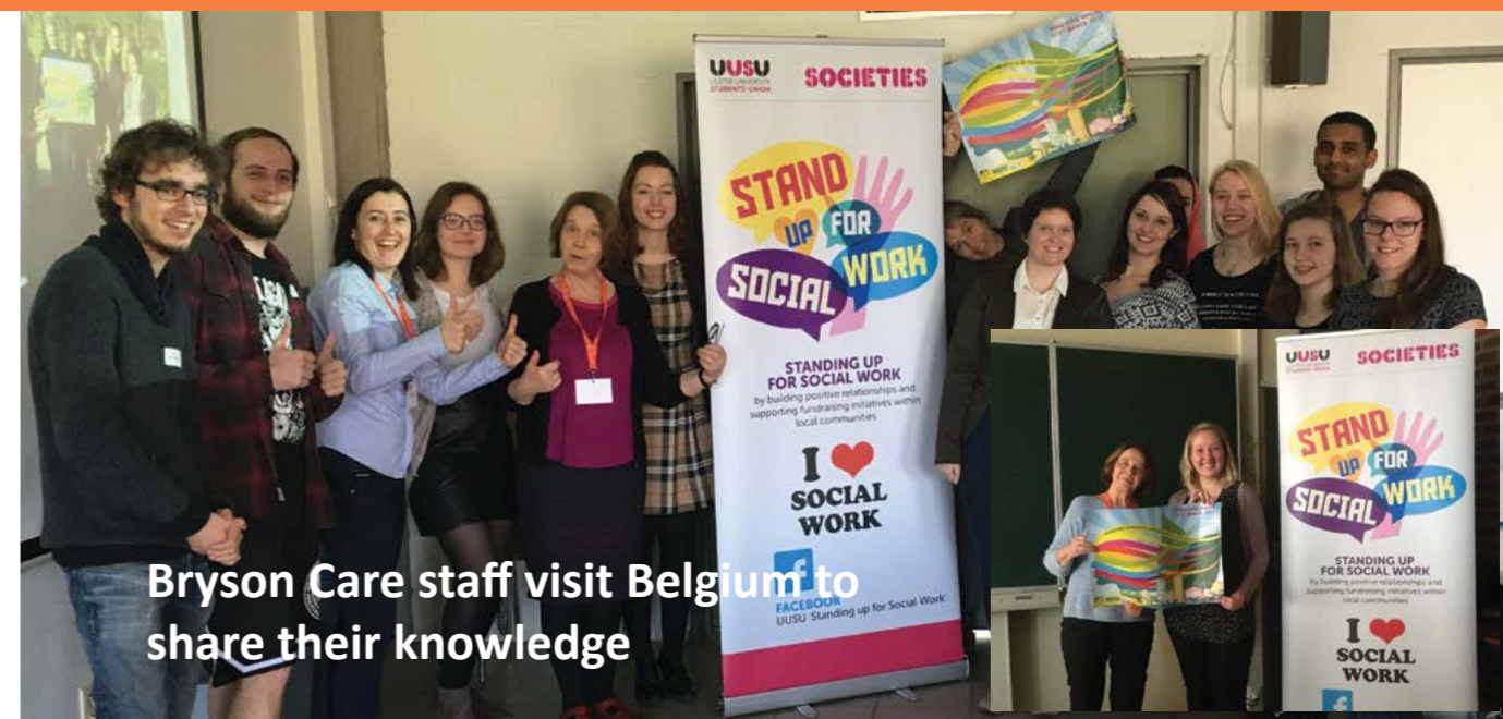
Bryson Care staff visit Belgium to share their knowledge