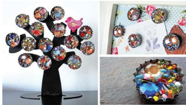
Treasure Magnets made with love, gems & bottle caps!