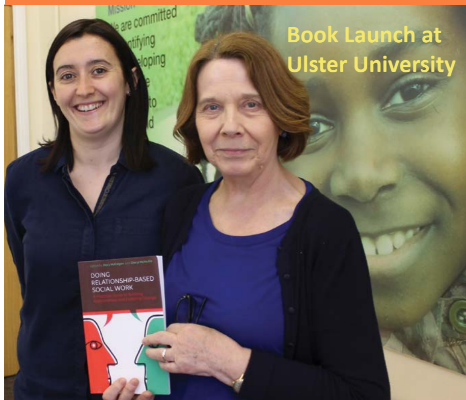
Book Launch at Ulster University